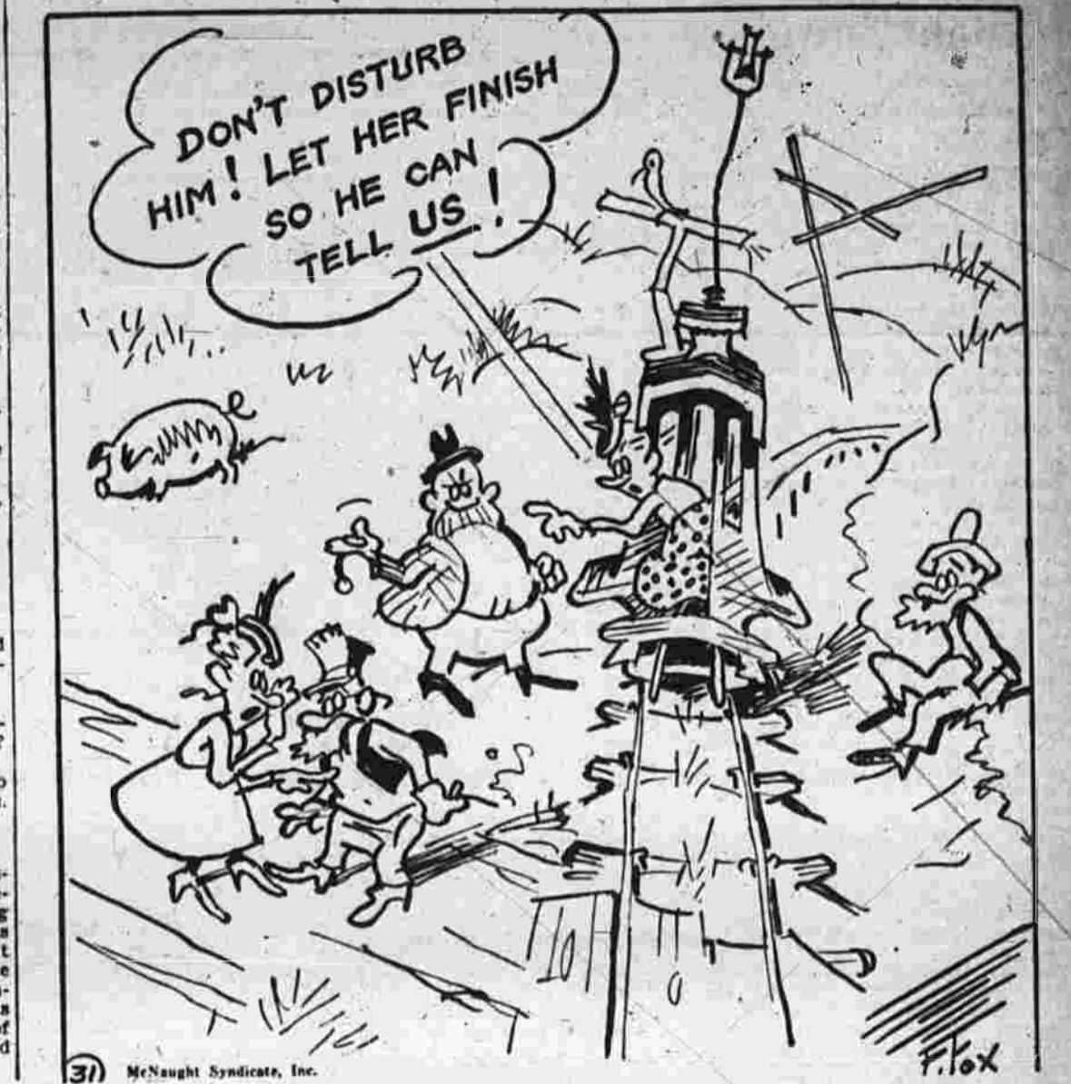
TOONERVILLE FOLKS BY FONTAINE FOX